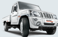
BOLERO MAXITRUCK PLUS