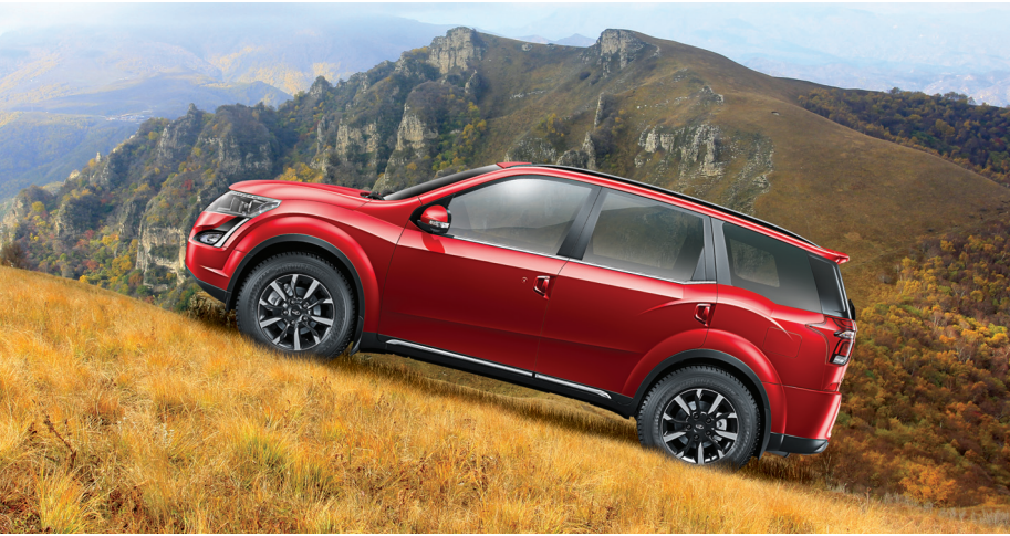
HILL DESCENT & HILL HOLD CONTROL

Your safety is our biggest priority, which is why the plush new XUV500 comes with this first-in-class technology feature. In case of an accident when the airbags are deployed, this feature automatically calls the emergency services.