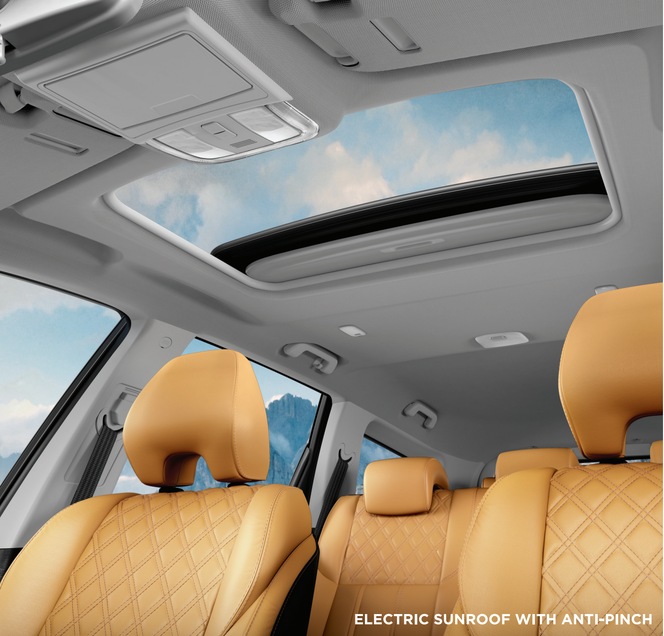
ELECTRIC SUNROOF WITH ANTI-PINCH

Step inside the new XUV500 and you can't help but feel pampered. The immaculate, soft-touch leather craftsmanship with fine stitch lines and piano black centre console add a dash of elegance to the dashboard. And the quilted, tan leather seats further accentuate this feeling of sophistication. But that's not all, look up and you will find the stunning electric sunroof with anti-pinch. Finally, the reduced noise levels, resulting in a much quieter in-cabin experience, ensures that even the most remote adventures, feel nothing short of 5-star extravagance.