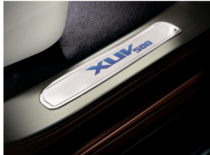
ILLUMINATED SCUFF PLATES