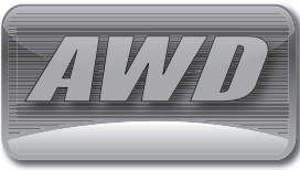
ALL WHEEL DRIVE