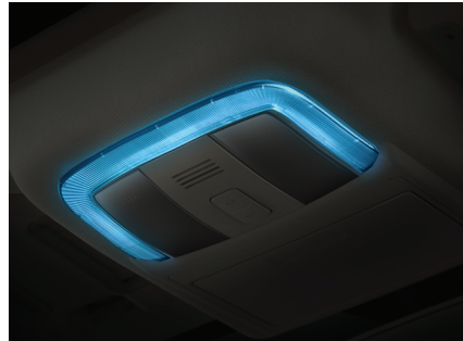
ICY-BLUE LOUNGE LIGHTING