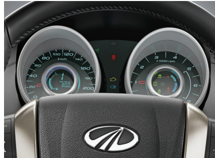
SPORTY TWIN POD CLUSTER