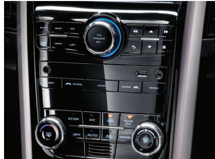
PIANO BLACK CENTRE CONSOLE