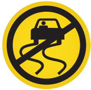
ELECTRONIC STABILITY PROGRAM WITH ROLLOVER MITIGATION SYSTEM

These headlights have a unique quality that light up the curves in the road when you turn the steering wheel. So, there will never be a surprise around the corner.