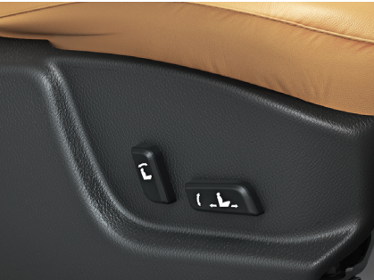
6-WAY POWER-ADJUSTABLE DRIVER'S SEAT

LUXURIOUS, SOFT-TOUCH, LEATHER DASHBOARD The dashboard and door trims have been fashioned with soft-touch, faux leather with fine stitch lines, elevating the interior's fit and finish by a few notches.